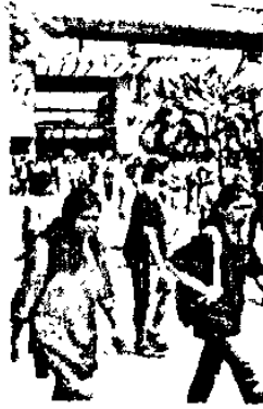
टेंशन बढ़ाएगा आईआईटी टेस्ट

मानव संसाधन विकास मंत्रालय और आईआईटी काउंसिल के बीच एंट्रेस टेस्ट के स्वरूप को लेकर हुए समझौते में राहत की बात सिर्फ इतनी है कि पिछले दो महीनों से इस सिलसिले में बना हुआ कम्प्यूजन खत्म हो गया है। इससे इंजीनियर बनने की खाहिश रखने वाले छात्रों का टेंशन कितना कम होगा, कोचिंग के धंधे पर कितनी चोट पड़ेगी और देश में इंजीनियरिंग शिक्षा की क्वालिटी किस हद तक सुधर पाएगी, इस बारे में यकीन के साथ अभी कुछ नहीं कहा जा सकता। समझौते से निकले एंट्रेस टेस्ट फॉर्मेट में लगभग एक महीने के अंतर पर एक स्क्रीनिंग और एक मुख्य परीक्षा का प्रावधान है। लेकिन दाखिले के साथ एक जरूरी शर्त यह भी जुड़ी है कि छात्र ने अपने इंटरमीडिएट बोर्ड एग्जाम में सबसे ज्यादा नंबर पाने वाले 20 प्रतिशत छात्रों में अपनी जगह बनाई हो। अभी आईआईटी में