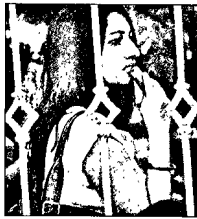
BAR CODE AT IITs

The IIT Council hammered out a new compromise formula on Wednesday, ending a month-long standoff between some IITs and the government. Earlier, anyone with the skill and stamina for the unrelenting, 8-10 hours-a-day prepara-